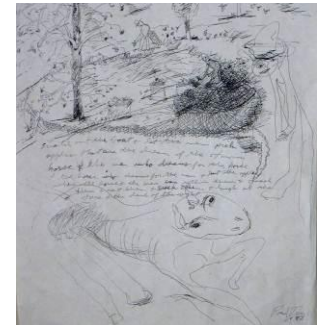
Kakashi hoes by Fred Tarr the dream of the starving horse: your love dry ... deep damp scratches