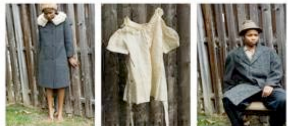
PHOTO FOCUS is a collaboration of photographs that appeals to diverse tastes within a sole medium.

Touchstone Gallery encouraged photographers in the surrounding area to enter their finest photographs, expecting only the best to fill Touchstone's walls.