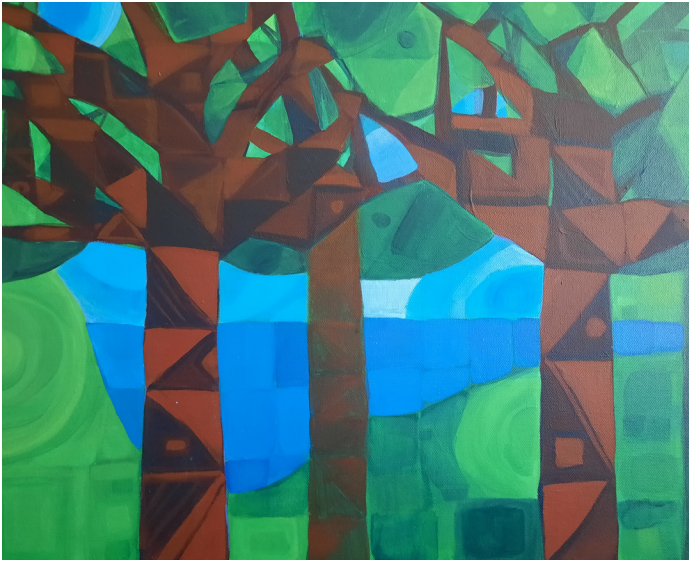
River Summer Forest Acrylic on canvas 24" x 20"